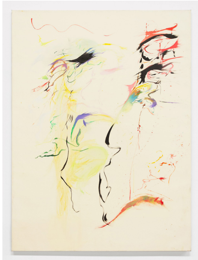
Whitney Claflin, "Strawberry pie," 2015. Oil, eye shadow and enamel on linen. 48 x 36 inches.

Lara Arafah, Topical Cream, November 30, 2023