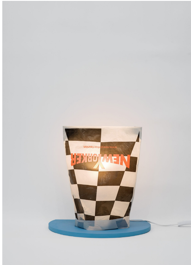
Whitney Claflin, “New Rainbow,” 2023. Wooden base with acrylic, plastic bag, iron plate weights, LED light bulb. Variable dimensions.

above, allowing her to explore the relationships between hues and values anew—and to create paintings that, she says, she never would have composed in daylight or under regular white lighting. Seeing them in a literal different light, this approach also changed her relationship to gestures and textures. “It was the first time I was able to feel that good loss of control,” she says. “I surprised myself.” She began using found objects and painting abstract forms in graduate school, too. “It made me feel like I was learning how to paint again because it became so open-ended,” she says.