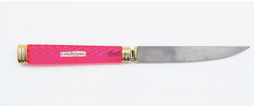
Above: Whitney Claffin, Sigh Co. , 2020, magazine clipping on knife, \frac{3}{4} \times 8 \times \frac{1}{2} ".