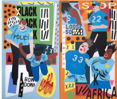
Nina Chanel Abney (b. 1992), What , 2015. Pigmented inkjet print, acrylic, and enamel on canvas. Photo: © Nina Chanel Abney. Family Collection. Image courtesy/Kruecke Whitney Gallery, New York.

ATM, cool, sorry we're closed —share space with geometric forms and bodies, as visually chaotic as the hurried world around us. In her 2015 painting What , central figures are surrounded by circles, Xs, hearts, and bars that fill and spill out of blocks of color defining the background. The overall effect is of a staccato rhythm that keeps the eye dancing around the canvas, alighting on high notes or getting lost in the noise. Her typically larger-than-life paintings envelop viewers and force a kind of confrontation with the elements of the work.